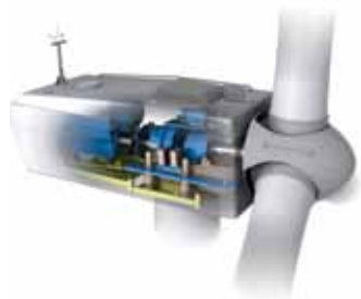
Drivetrain Instrumentation Bently Nevada accelerometers and speed sensors

Early warning/detection can reduce crane costs by identifying problems soon enough to perform some maintenance up-tower.