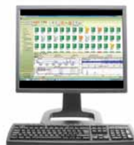
ADAPT Wind Software Trending and diagnostic analysis

ADAPT Wind customers have reported annual savings of $1000-$3000 per turbine for new units.