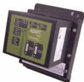
Bently Nevada 3701 Series Wind Turbine Monitor Powerful continuous up-tower signal processing